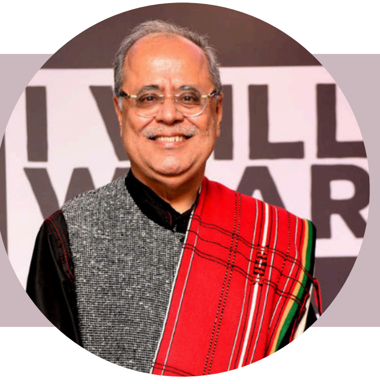
ATUL BAGAI Former UNEP India Head of Country Office