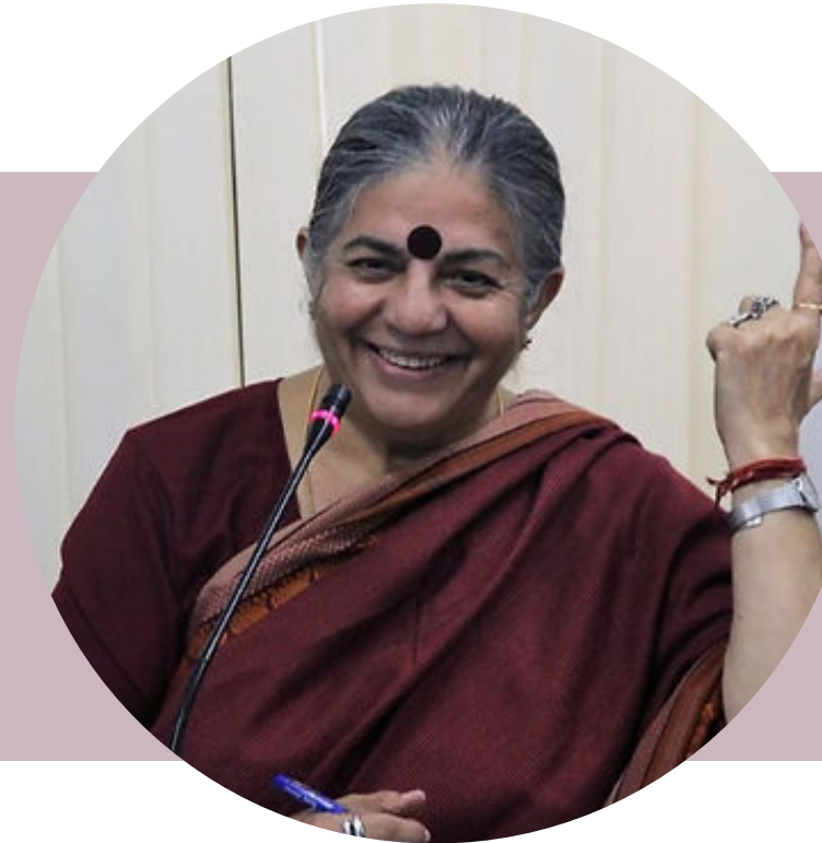
VANDANA SHIVA Environmental Founder, Navdanya