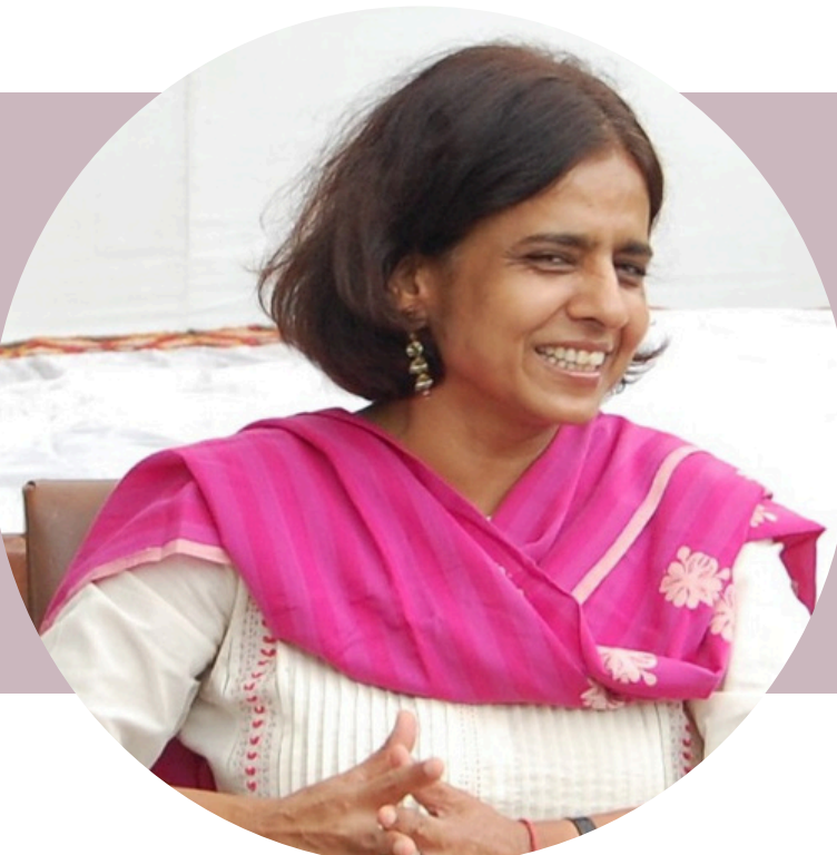
SUNITA NARAIN Environmental Political Activist