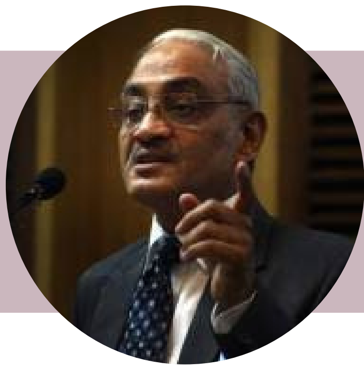
JUSTICE SWATANTER KUMAR Former Chairperson, National Green Tribunal